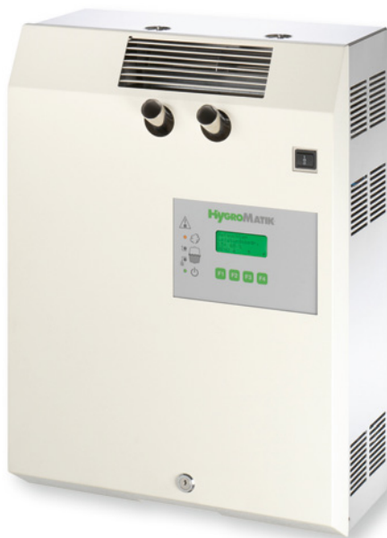
HygroMatik MiniSteam Comfort Steam output max. 10 kg/h

The HygroMatik MiniSteam is a steam humidifier for direct room humidification. The MiniSteam generates clean mineral-free steam from standard tap water. The quiet integrated fan distributes the steam evenly.