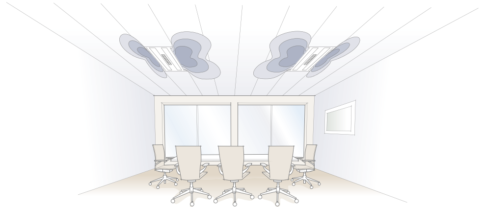
Example of air flows and flow pattern adjustable using comfort control and FPC.

IQID can also be prepared for sprinkler system integration, which minimizes disturbing elements in the ceiling.