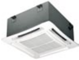
Cassette unit QDFD.