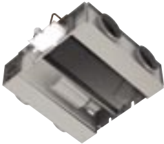
Fan coil QZSC.