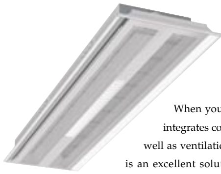
Chilled Beam IQID.