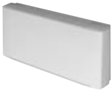
Fan coil QZM/QZT.

When you need a system that integrates cooling and heating as well as ventilation, the chilled beam is an excellent solution. Our induction beams are designed for managing high cooling effects with an advantageous life-cycle cost.